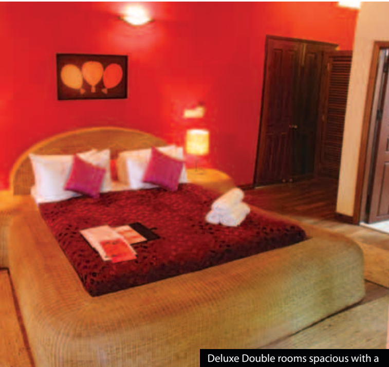
Deluxe Double rooms spacious with a