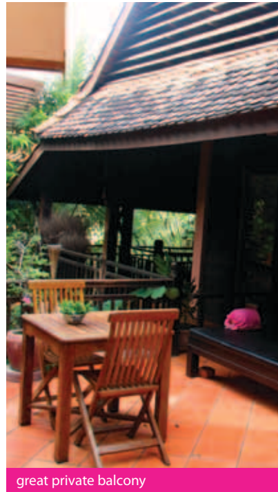
great private balcony

Our hotel features a cool jungle garden area and pool with a waterfall and shallow play area for children. The